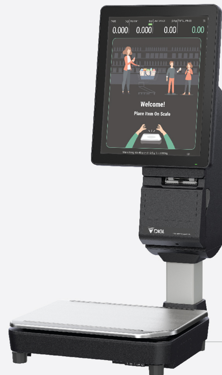
SM-6000 SSP 15"

PC Based Self-Service System Scale Printer